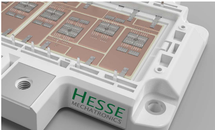
Welded and Wire Bonded Power Module

Smart Welder can, like ultrasonic wire bonders, flexibly handle a large variety of products. New products only require a program change and possibly adapted clamping and automation.